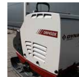
all round hard shell

Base-plate is highly wear resistant thanks to the material and construction. Extra layer of protection by powder coating ensures long life time.