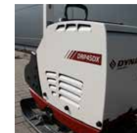
all round hard shell

Base-plate is highly wear resistant thanks to the material and construction. Extra layer of protection by powder coating ensures long life time.