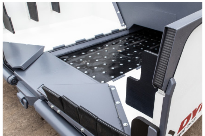
LARGE CONVEYOR TUNNEL FOR BULK MATERIAL TRANSFER

Dynapac feeders are best known for their powerful and durable conveying systems. The 1200 mm wide conveyor with