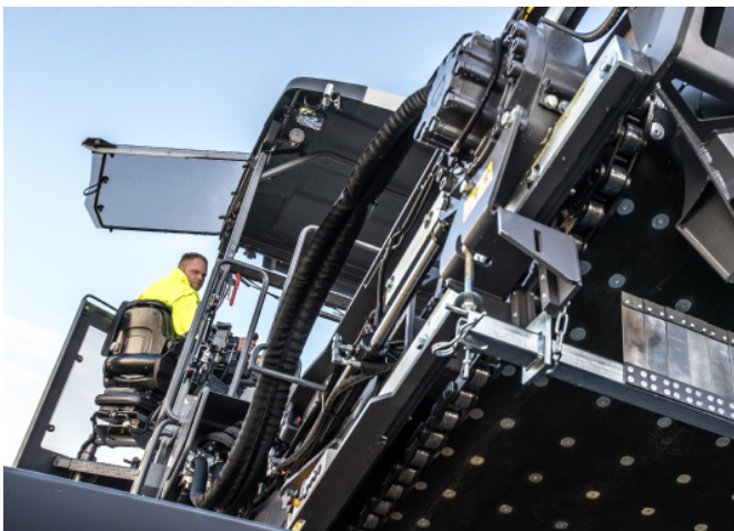
HEIGHT ADJUSTABLE PLATFORM FOR EXCELLENT OVERVIEW