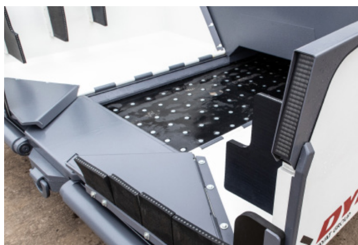
LARGE CONVEYOR TUNNEL FOR BULK MATERIAL TRANSFER

Dynapac feeders are best known for their powerful and durable conveying systems. The 1200 mm wide conveyor with